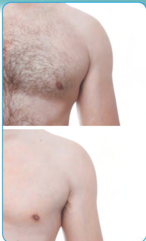
PERMANENT EPILATION CLEAR SKIN