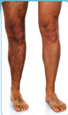
PERMANENT EPILATION DARK SKIN